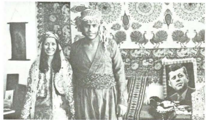
Iranian exhibit featured priceless carpetry.