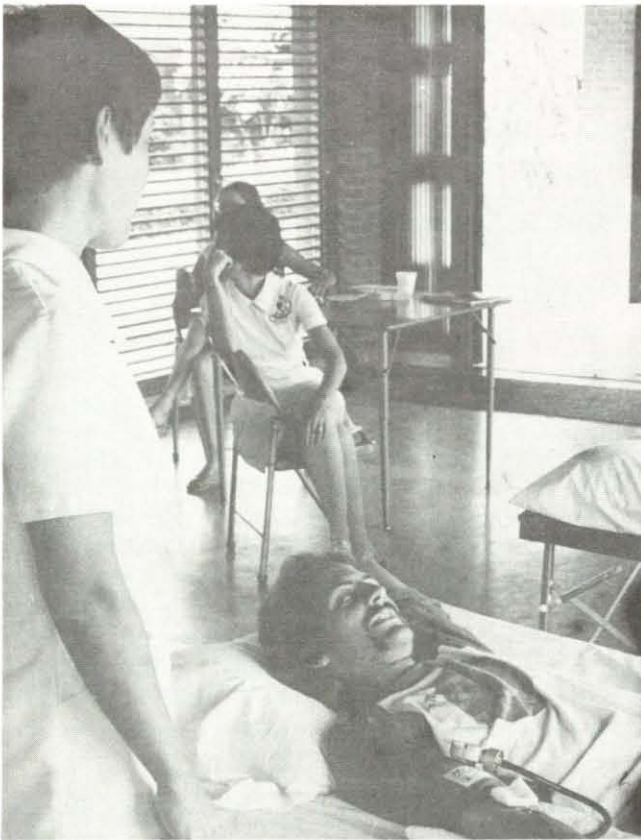
Scene at Jensen Beach Campus during blood drive conducted by volunteers from the Palm Beach Blood Bank. Students, faculty and staff were the donors in the semi-annual drive.