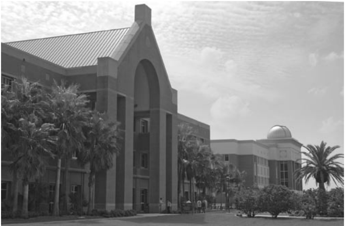
The F.W. Olin Engineering Complex and the F.W. Olin Physical Sciences Center are two of Florida Tech's newest classroom and research laboratory facilities.

*Required for nonthesis students during the graduating semester.