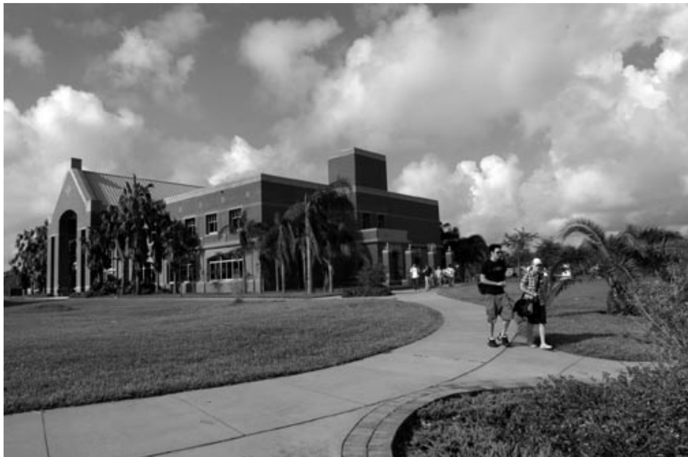
The F.W. Olin Life Sciences Building is the home of the biological sciences program's offices, classrooms, and teaching and research laboratories.

SYS 5999 THESIS RESEARCH IN SYSTEMS ENGINEERING (0–3 credits). Individual research under the direction of a member of the graduate faculty in a selected systems engineering topic. May be repeated for a maximum of six credits. (Requirement: Thesis adviser approval.)