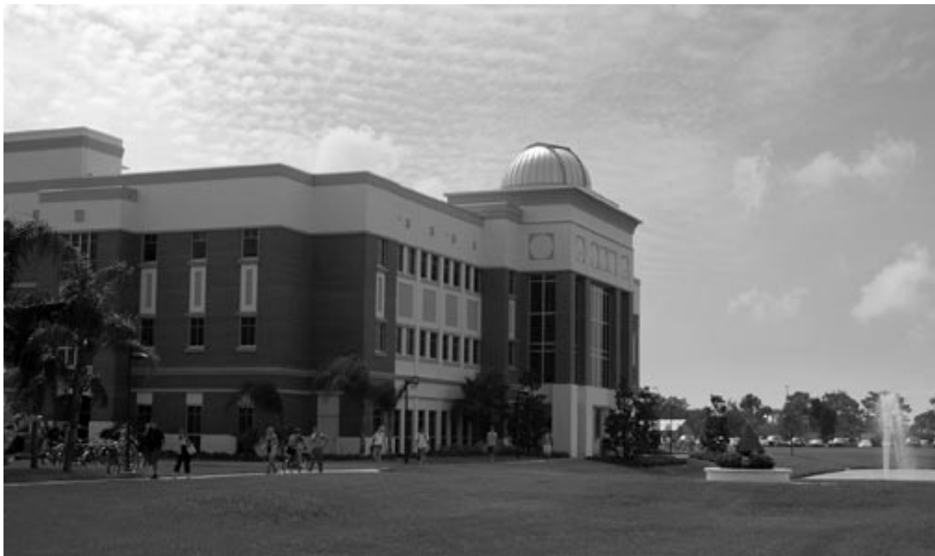
The F.W. Olin Physical Sciences Center hosts classrooms, laboratories and an observatory dome that will house a 32-inch telescope, the largest in the state of Florida.