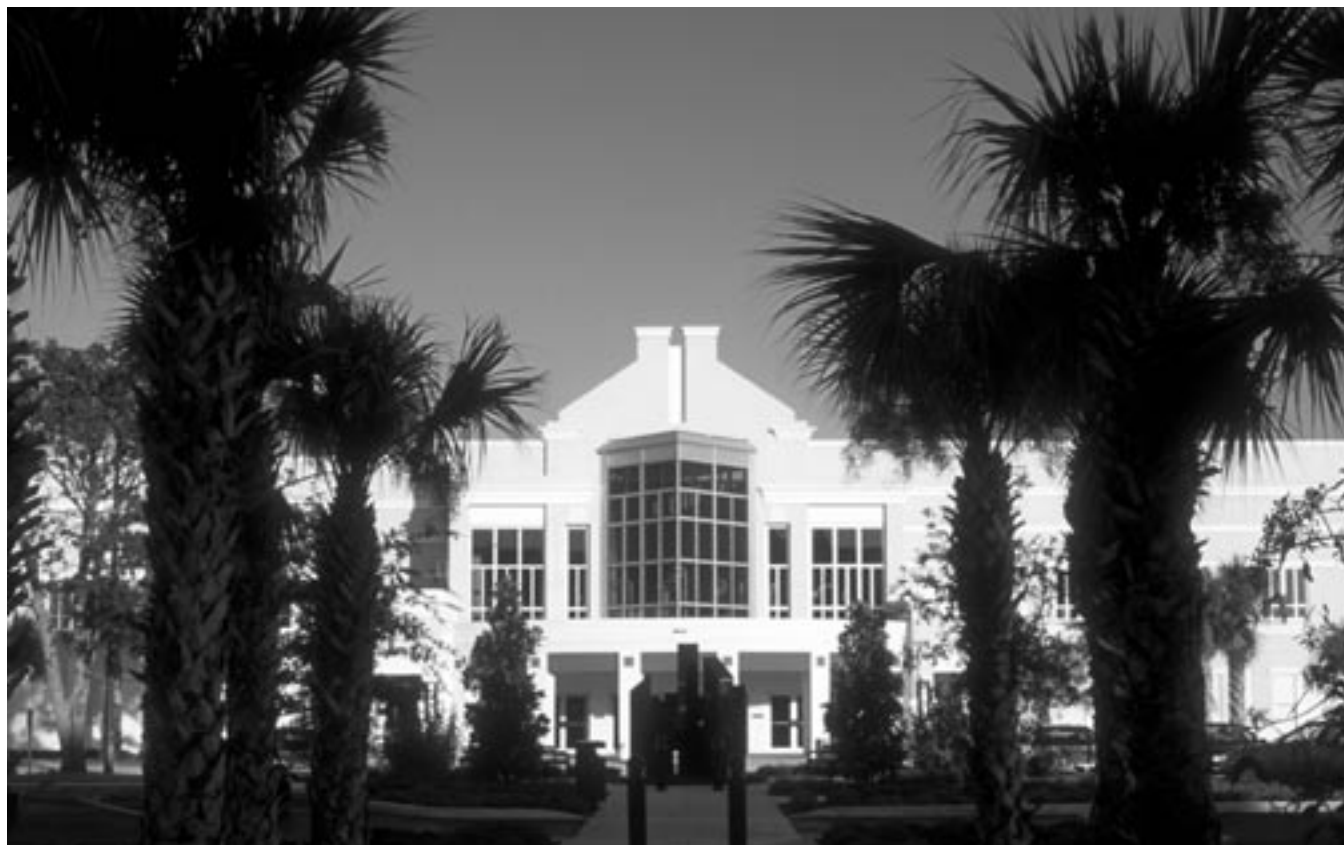
The Charles and Ruth Clemente Center for Sports and Recreation houses varsity and intramural basketball courts, a racquetball court, a complete fitness center, volleyball and badminton courts, and the athletic department offices.

Additional information on these programs and others may be obtained from the Office of Graduate and International Programs.