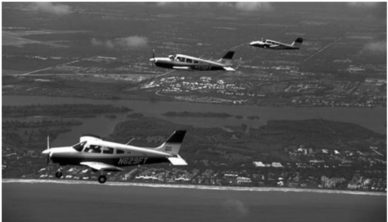
Three of Florida Tech's flight training fleet.