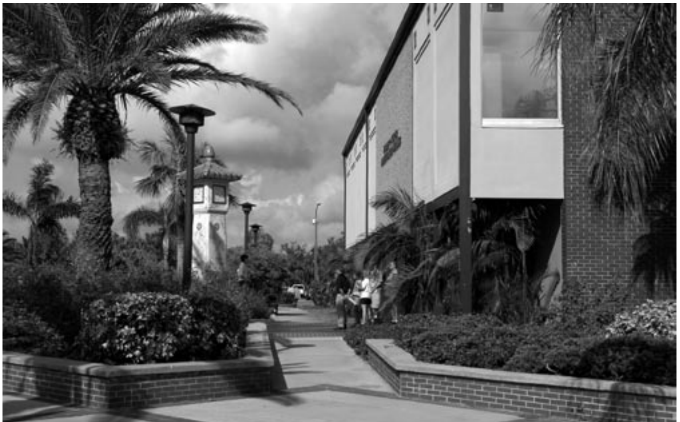
The Keuper Administration Building houses graduate and undergraduate admissions, student affairs, financial aid, international student and scholar services, and career services.

Students are expected to be familiar with the “Code of Conduct and University Discipline System” detailed in the Student Handbook .