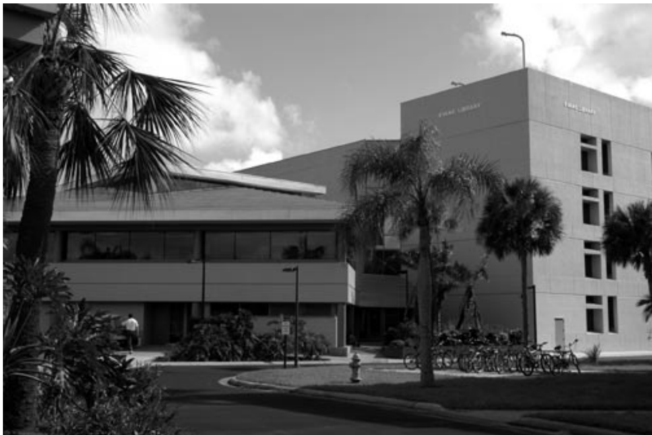
The John H. Evans Library provides electronic resources that complement the print, government documents and audio visual collections. A multimedia equipped classroom and a computing center are also available.

Florida Tech students whose undergraduate major is outside of the business area may satisfy some or all of the core course requirement through Free Electives, Social Science Electives, and Business or Technical Electives, as listed in their program of study. In some cases an extra three-credit overload will be required for one semester to complete the four core courses. The students may then complete the M.B.A. requirements in one additional calendar year (three consecutive semesters). Interested students should consult with their academic adviser and contact the associate dean in the College of Business.