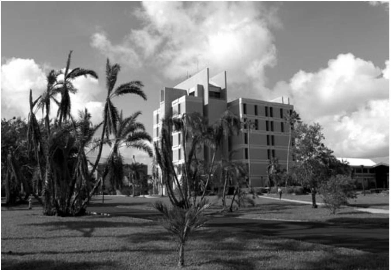
The seven-story Crawford Building houses laboratories, classrooms and faculty offices for the mathematical sciences, and humanities and communication departments.