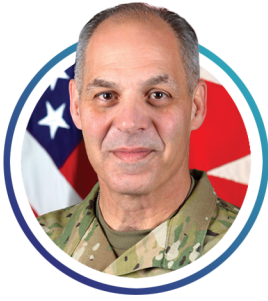
GEN. GUSTAVE PERNA

Chief operating officer for the COVID-19 Vaccine and Therapeutics Operation