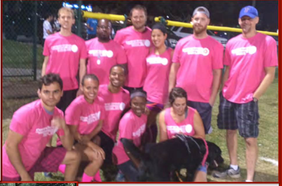
We have current students, friends of the program, and pets of the program rounding out our roster.

What type of scientists would we be if we didn't adhere to the research that suggests we need to take time to recover and restore our resources? One way our students have been applying their knowledge this semester is by playing on an intramural kickball league! Our roster includes 1<sup>st</sup> through 5<sup>th</sup> year students. We proudly introduce THE CONTROL GROUP!