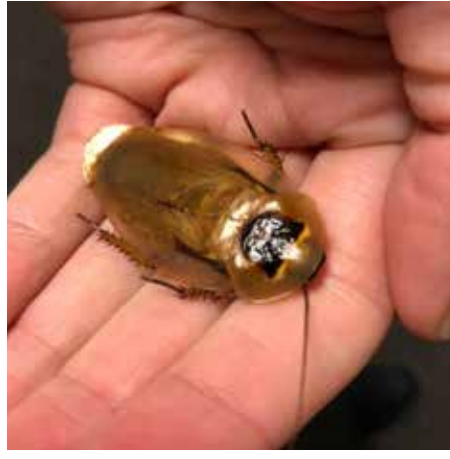
Cockroach used for in class demonstrations

In December 2017 the Association for Psychological Science awarded us a teaching grant to test out using roaches in the classroom. We are going to replicate several experiments demonstrating phenomenon like classical and operant conditioning and post the plans and materials for those experiments online. We believe that this could encourage other universities to do the same.