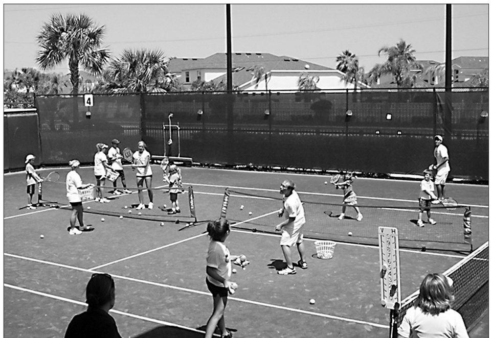
Florida Tech tennis team members teaching Scott Center children and their siblings

Aces for Autism addresses the specific needs of children with autism and their families by providing coordinated recreation; this assists in social skills, physical movement and activity. "Aces" also offers an opportunity for Scott Center families to enjoy a leisure activity together. The Scott Center at Florida Tech is dedicated to providing the highest quality treatment, training and applied research to enhance the functioning and improve the quality of life of children with autism and related disabilities in Central Florida.