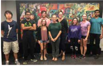
The Florida Tech Public Relations Club aims to use communication to connect students with campus and community activities.