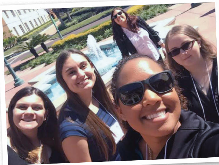
Members of the Prelaw Society of Florida Tech enjoy themselves during an open house visit to Stetson University College of Law in Gulfport, Fla. on Feb. 27.

The Prelaw Society is currently looking for guest speakers, mentors and tutors for 2016–2017.