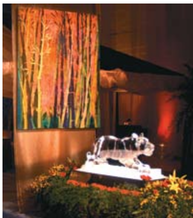
Feature Story: An evening of celebration