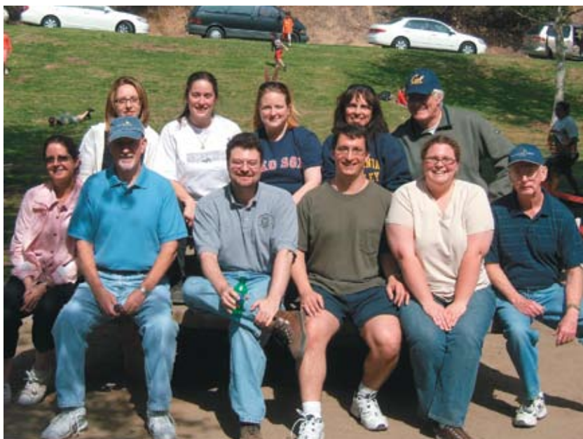
California Alumni Say "Cheese" The close-knit L.A. alumni chapter gathers at Griffith Park in Los Angeles for its third annual chapter barbecue and softball game.

Make plans to join us for the Golden Anniversary! Go Panthers!