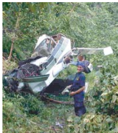
Feature Story: NTSB Investigator