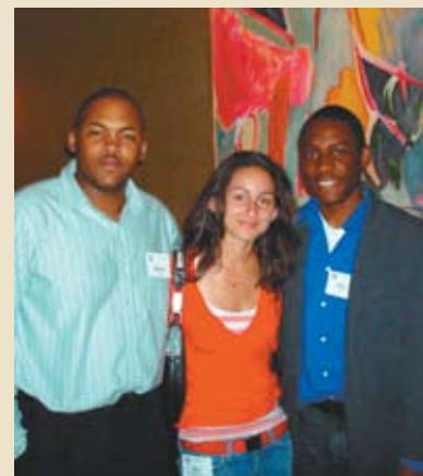
On the Road with alumni in Seattle