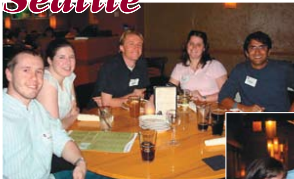
(Two photos at left) Tuesday, June 19 found alumni, spouses and guests gathered for an enthusiastic reception at Seattle's Tap House Grill.