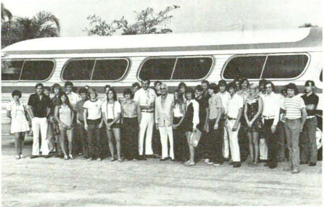
Tour group heads for S.O.M.E.T.