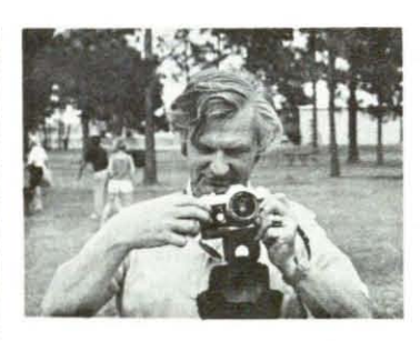
Faculty/Staff Picnic Rodes Park May 31, 1975