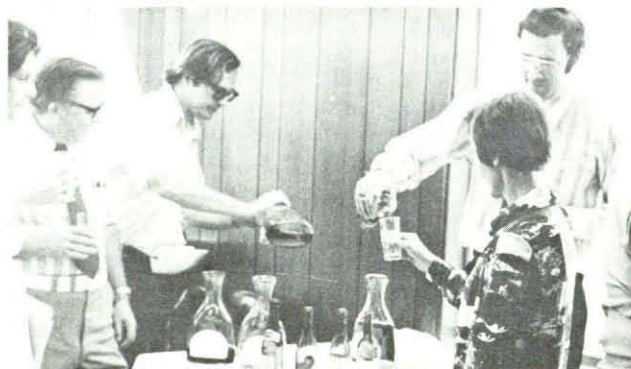
The faculty, administration, and office staff were treated to an unusual luncheon extra on Tuesday, April 27. A wine and cheese tasting party was provided by the university food service management in the faculty dining room in the Student Union Building.

MAY 11 I.F.C. Greek Week Skits, 6:00 p.m., F.I.T. Auditorium.