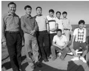
The first group of eight Mongolian pilots enjoy an area field trip.

Four groups of Mongolian commercial airplane pilots will be here this year to prepare for the International Civil Aviation Organization (ICAO) exam. This is a spoken exam emphasizing English language skills. Pilots who pass the test are allowed to fly into large international airports.