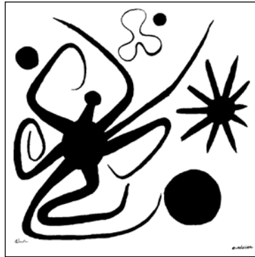
"The Sea" by Alexander Calder