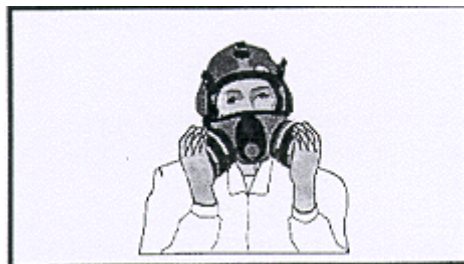
User Seal Check: worker covering inlet and inhaling (negative pressure check)

A: Yes, employees using tight-fitting facepiece respirators are required to perform a user seal check each time they put on the respirator. They must use the procedures in Appendix B-1 of 29 CFR 1910.134 or procedures recommended by the respirator manufacturer that the employer demonstrates are as effective as OSHA's procedures. Note that a fit test is a method used to select the right size respirator for the user. A user seal check is a method to verify that the user has correctly put on the respirator and adjusted it to fit properly, as illustrated below.