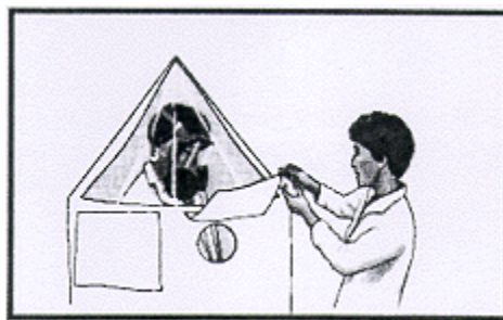
Qualitative Fit Test Chamber

A: Proper respirator size is determined through a fit test. Employees using negative or positive pressure tight-fitting facepiece respirators must pass an appropriate fit test using the procedures detailed in OSHA's respirator standard.