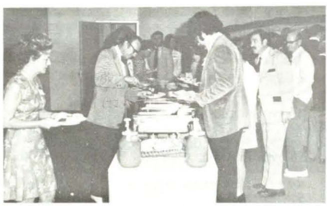
Luncheon at Student Center