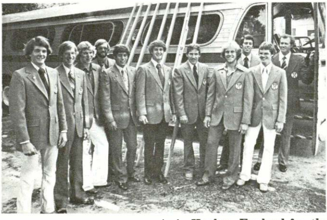
F.I.T.'s Championship crew is in Henley, England for the Henley Royal Regatta.