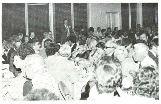
ALUMNI REUNION LARGEST EVER

Laughter permeated the building as jokes flew fast and unedited at the annual Alumni/Faculty Banquet on Saturday, February 17 , the final day of F.I.T.'s Homecoming Week. Over 300 people attended the banquet which culminated a day of activities planned especially for the visiting alumni.