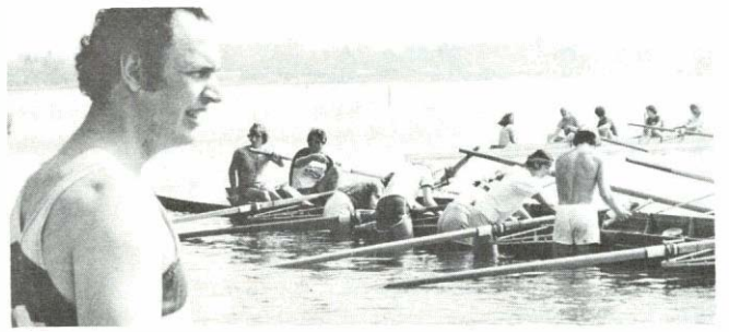
Alumni crew prepares shell for feature race.