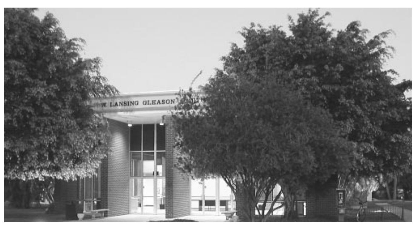
School of Extended Graduate Studies – Acquisition and Contract Management 153

Electives may be taken with the approval of both the faculty adviser and the program head from other graduate-level offerings in the School of Extended Graduate Studies, or other schools or academic units.