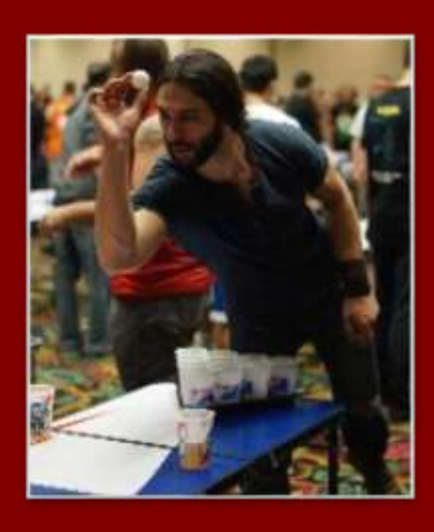
Hometown: Newtown, PA Undergraduate Institution: Bloomsburg University Favorite city in the world: Florence, Italy Bucket list item: Hike the Nepali coast Something about you that would surprise your classmates: I used to compete in dance competitions and I am a 2<sup>nd</sup> degree black belt