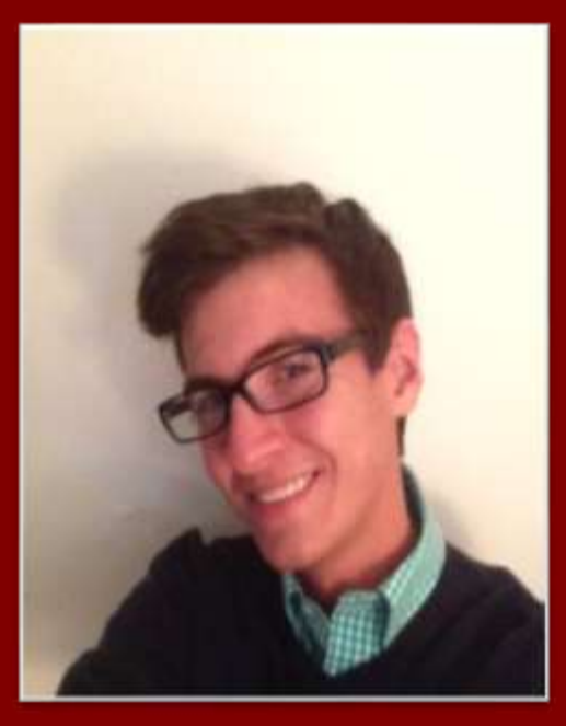
Hometown: Bright, IN Undergrad: Florida Institute of Technology Favorite first year memory so far: The beach bonfire with the upper years Something about you that would surprise your classmates: I used to do a lot of community theater and acting. I was also formally trained in vocals.