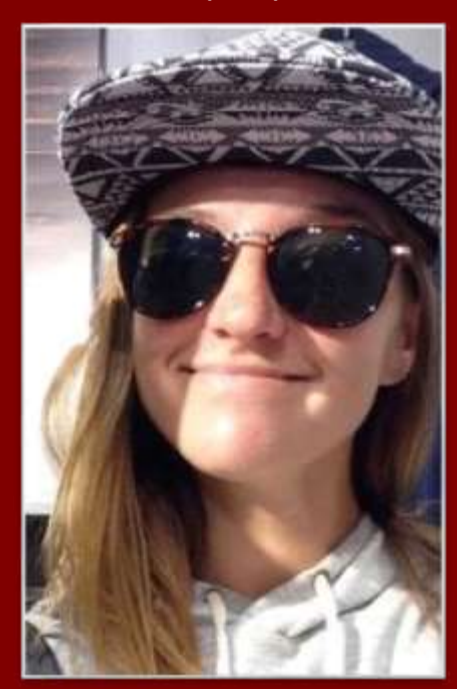
Hometown: Wellington, FL Undergrad: Southern Methodist University Favorite city in the world: Prague, Czech Republic Bucket List Item: Cage diving with Great White sharks Something about you that would surprise your classmates: I wear unicorn slippers