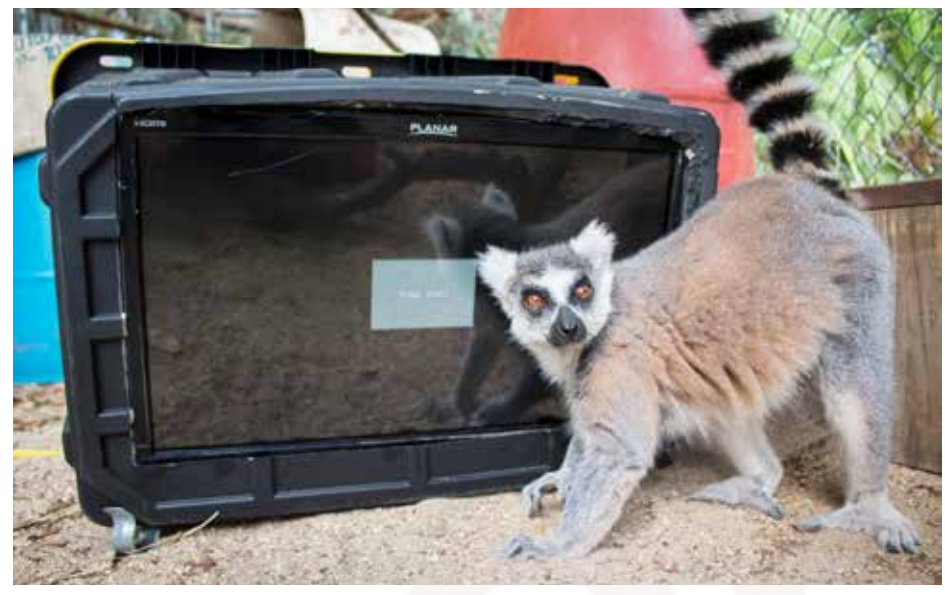
Matilda, a ring-tailed lemur housed at Brevard Zoo, performs cognitive tests via a touchscreen computer.

In addition to this line of research on animal wellness, we are also working on a number