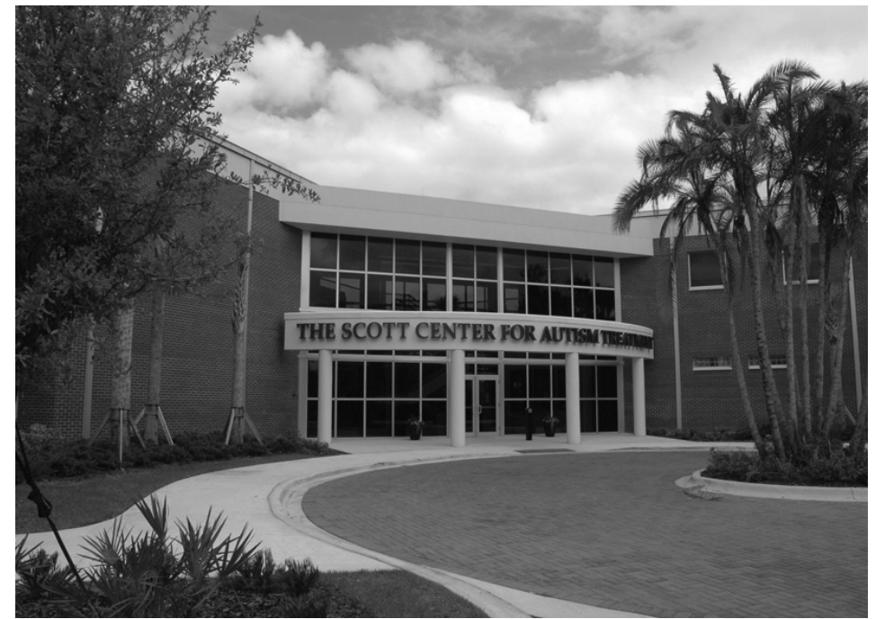
The Scott Center for Autism Treatment, which is also home to Scott Center Psychological Services.

at Florida Institute of Technology with Community Psychological Services practicum, the faculty closely monitors students' application of their knowledge base and guides them through the phases of treatment. The students benefit from the experience under the watchful eye of the supervisor. Most importantly, CPS clients are provided with treatment that has been proven successful and the success of treatment is tracked by a measure that has high validity and reliability.