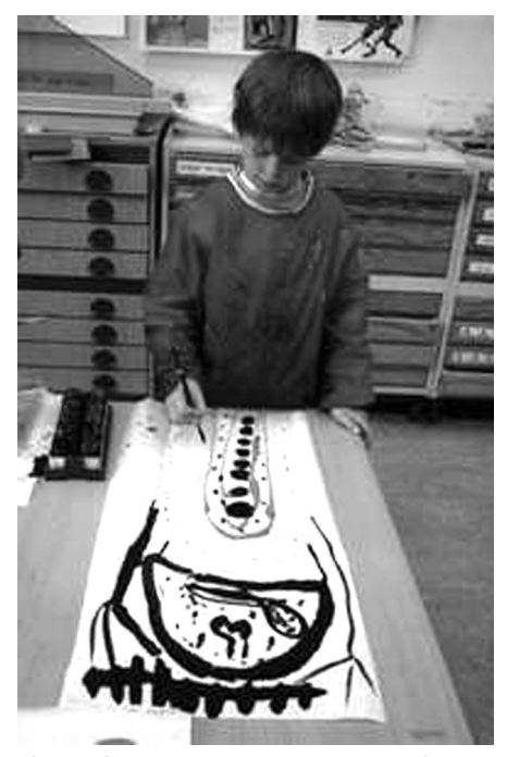
The Family Learning Program incorporates the arts and other play therapy techniques when working with young clients.

The non-offending caregiver is directly involved with the victim's therapeutic process in FLP. In addition to receiving information about sexual abuse and sexual development, non-offending caregivers are provided with behavior management strategies specifically aimed at handling problematic behavior of traumatized children. Coping resources and techniques are also discussed in order to alleviate feelings of distress experienced by the non-offending caregiver. Research has shown many benefits of including treatment for the non-offending caregivers of sexually abused children using the TF-CBT model, including an increase in positive parenting practices and a higher degree of improvement in the child's depressive symptoms and behavior problems in comparison to child-only treatment. The impact of sexual abuse is undoubtedly far-reaching, as parents and children work to process the trauma and cope with the