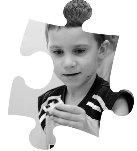
Evidence-based practice is the key piece to addressing the autism puzzle.

The mission of The Scott Center for Autism Treatment is to create treatment programs that address an array of domains of functioning, are individualized to the unique needs of each client, and are based on sound scientific findings. Another important mission is to educate parents and caretakers about the use of these evidence-based treatments. In addition to educating families about what works, it is also valuable to let them know what the research has to say about non-evidenced-based