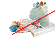
NO Loose Plastic Bags, Bagged Recyclables or Film

Empty recyclables directly into your bin.