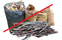
NO Green Waste

Empty recyclables directly into your bin.