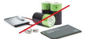
NO Batteries - check local drop-off programs for proper disposal